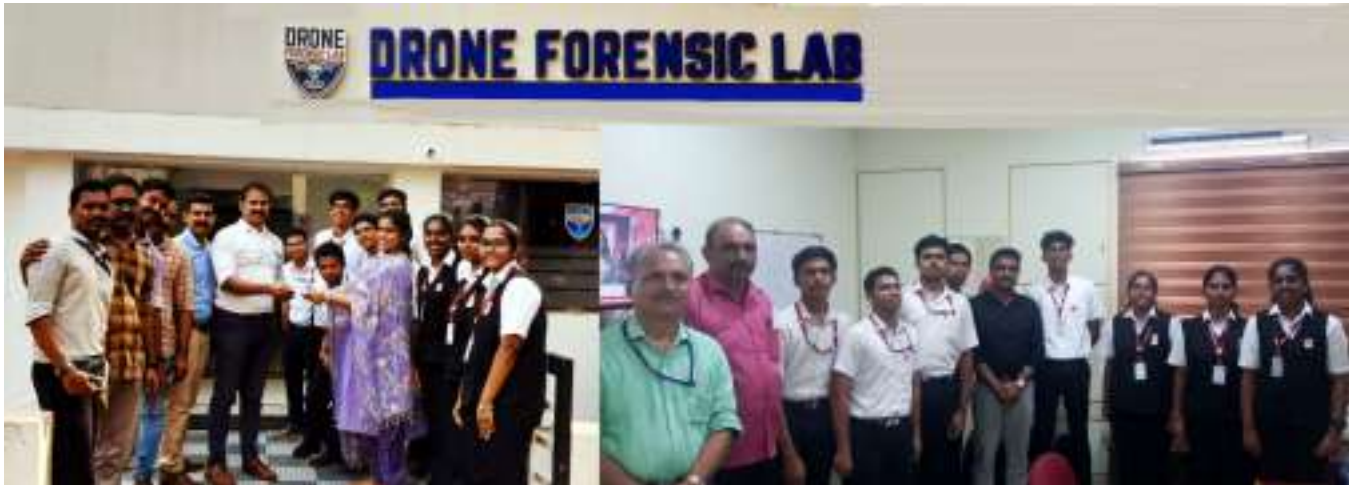
Kerala Police Drone Forensic Lab