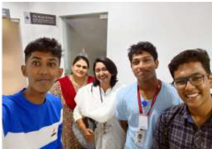
Gitanjali Eye & ENT Hospital