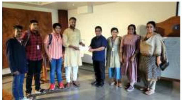
Dr Unni's Agastyaa Heritage Ayurvedic Hospital