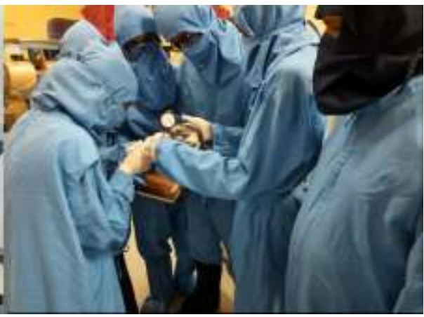
Hindustan Lifecare Limited