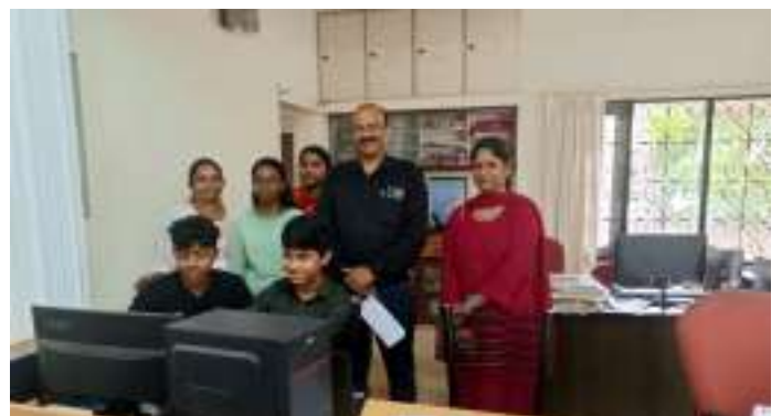
Gopal & Anil Associates (CA)