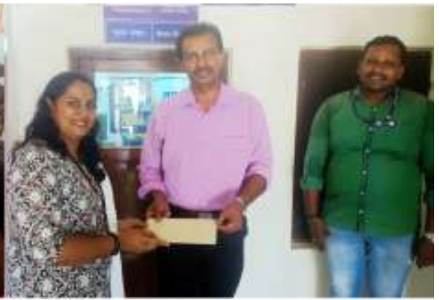
NCSCDA (National Career Service Centre for Differently Abled)