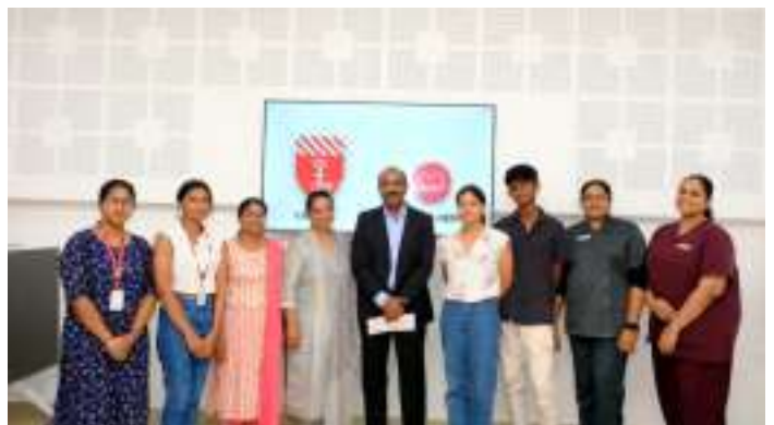
Kamala Dental Clinic