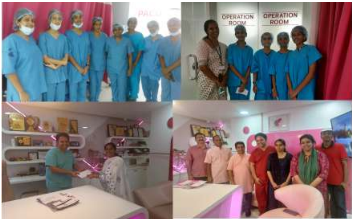
Yana Women's Hospital & Fertility Centre