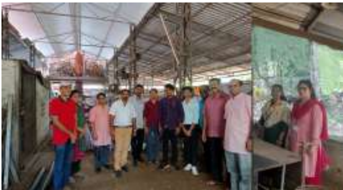
Jacob Engineering Works